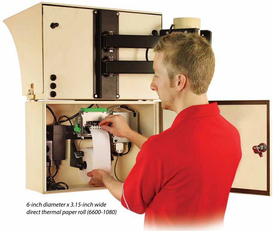
6-inch diameter x 3.15-inch wide direct thermal paper roll (6600-1080)

These unattended weighing terminals allow the driver to remain in their vehicle while weighing which reduces the risk associated with walking across truck scale platforms and traffic lanes. Not only is this a safer method of receiving truck weights, but it also speeds the weighing process for optimal efficiency and reduces overall operating costs.