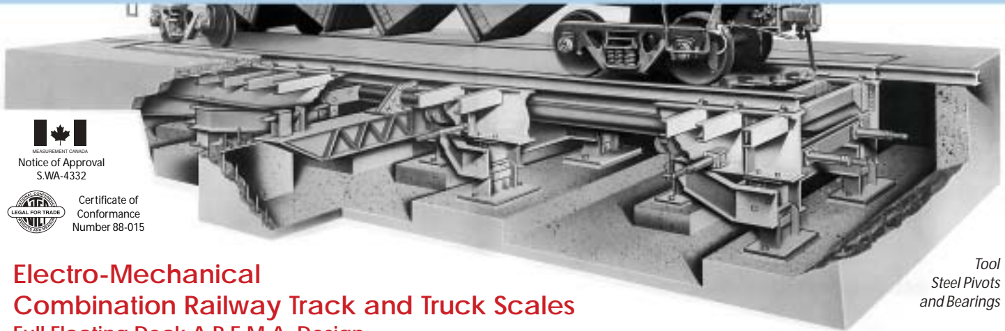
Tool Steel Pivots and Bearings

MEASUREMENT CANADA Notice of Approval S.WA-4332