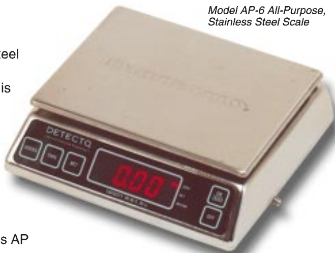
Model AP-6 All-Purpose, Stainless Steel Scale

Whatever the weighing situation, Detecto's AP Series stainless steel scales are built to perform day after day, year after year, with dependability and accuracy. Its rugged, stainless steel enclosure is easy to clean and resists rust stains and corrosion. Special over load stops prevent accidental damage during its use. The 1/2" high red LED display is angled for easy viewing as is the keypad which contains operator controls plus push button tare. Advanced features, such as our exclusive setup review feature allow the operator to tailor the weight display to specific needs such as response rate, vibration filtering and other operational parameters. If you are in need of a performance-base, value-added bench or counter scale, Detecto's AP Series stainless steel scale is a product you can rely on with confidence.